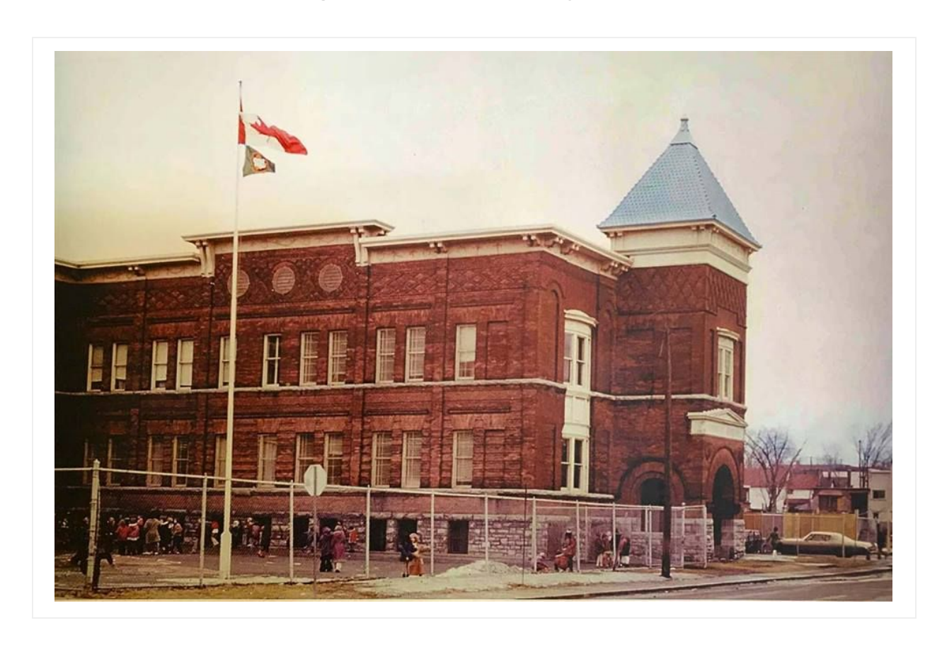
The first Cambridge Street Community PS was built in 1898.