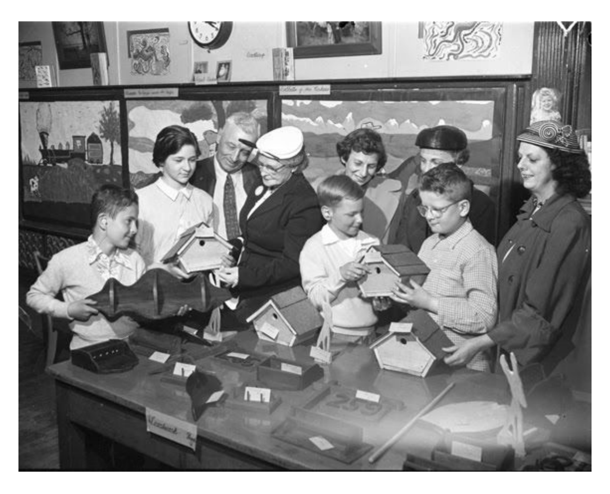
Cambridge School Exhibition

A group of students showing adults their birdhouses. 1956-05-23